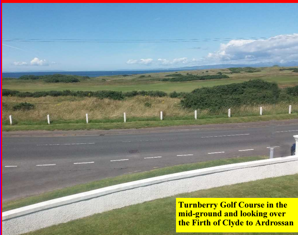
Turnberry Golf Course in the mid-ground and looking over the Firth of Clyde to Ardrossan